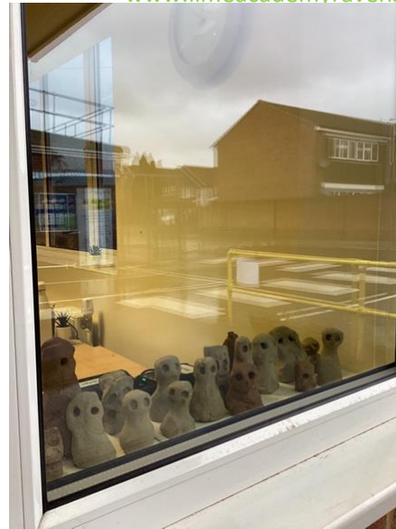
Reeve Class creating textures in clay and creating contributions to the Field of Love